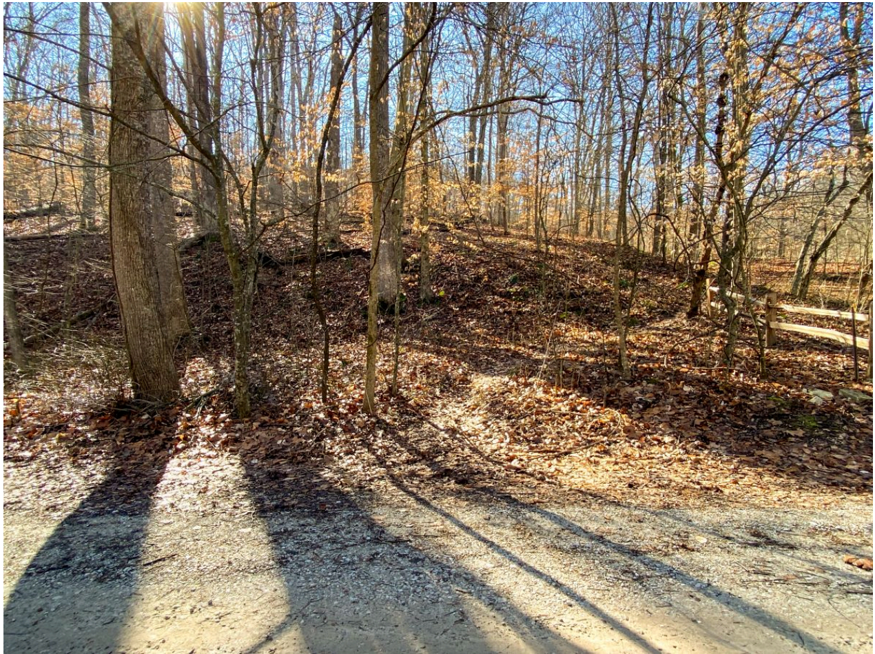
Browning Mountain Stonehenge Trailhead