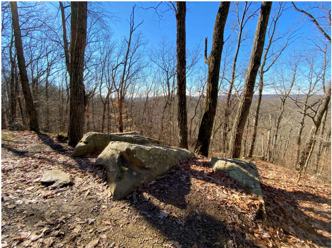
Rocks at the Top of Browning Mountain

Related: 10 Best Places to Visit in the Upper Peninsula of Michigan