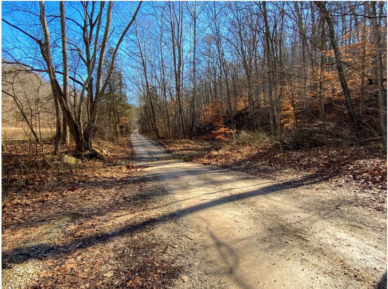
Dip in the Road Past the Trailhead

Searching "Browning Hill" in Apple Maps brought us to the correct location and it seems that "Browning Mountain Trailhead" in Google Maps is correct as well.