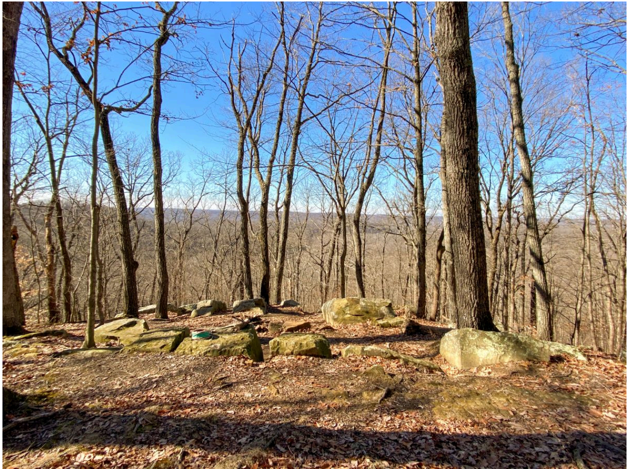
The Top of Browning Mountain Indiana's Stonehenge