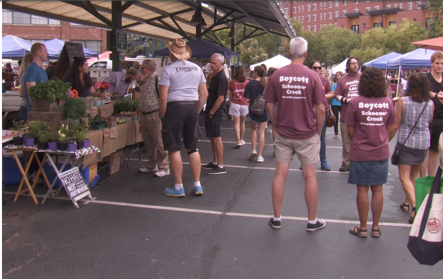
Protestors in front of the Schooner Creek Farm stand at the Bloomington Farmer's Market, taken Sept. 21, 2019.

opposition from local governments, schools