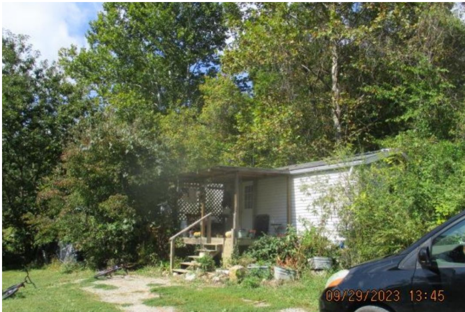
The Schooner Creek Farm property, taken Sept. 29, 2023.

Schooner Creek Farm, the controversial farm in Brown County, has been sold.